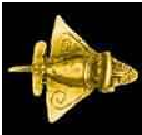
Aircraft found in the great pyramid, Egypt.

He rode upon a cherub, and did fly: yea, he did fly upon the wings of the wind.— Old Testament: Psalms XVIII, 10, circa 150 B.C.