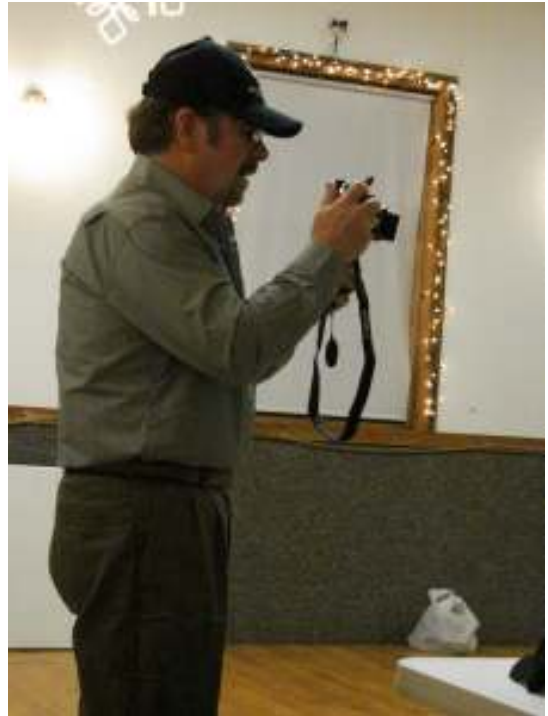
Web Editor doing what he always does take pictures.