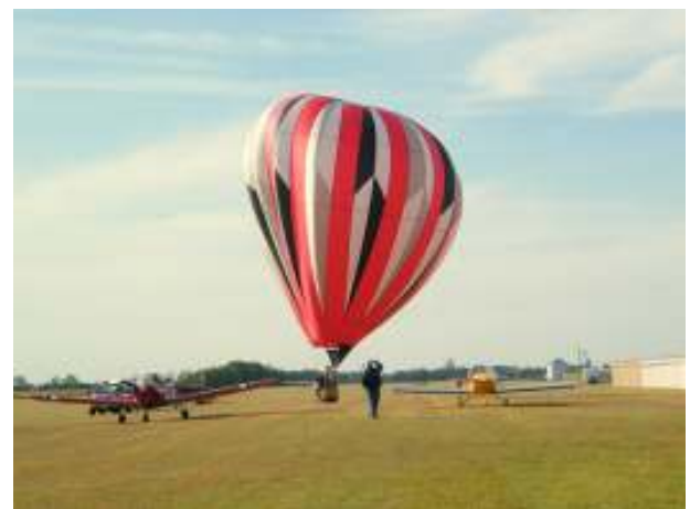
The plan was to have tethered balloon rides available, but the winds prevented that. It would have fun. Maybe next year.