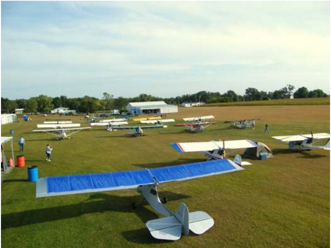
With the new Challenger Ultralight in the foreground and a beautiful day on hand we had 50 + aircraft and plenty of drive in company.